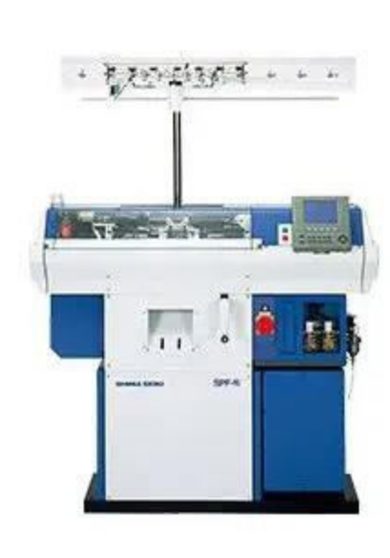
SPF-W (14 Units) Japanese Toe Sock Flat Knitting Machine