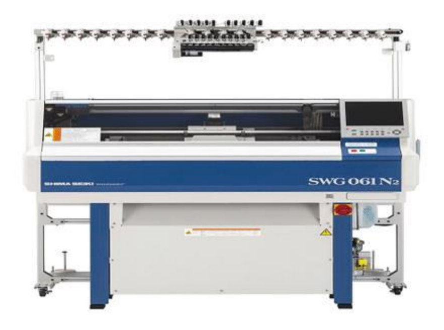
Whole Garment (10 Units) Best Japanese Flat Knitting Machine